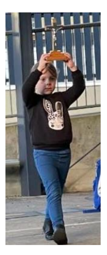
Upcoming Liturgical Celebrations