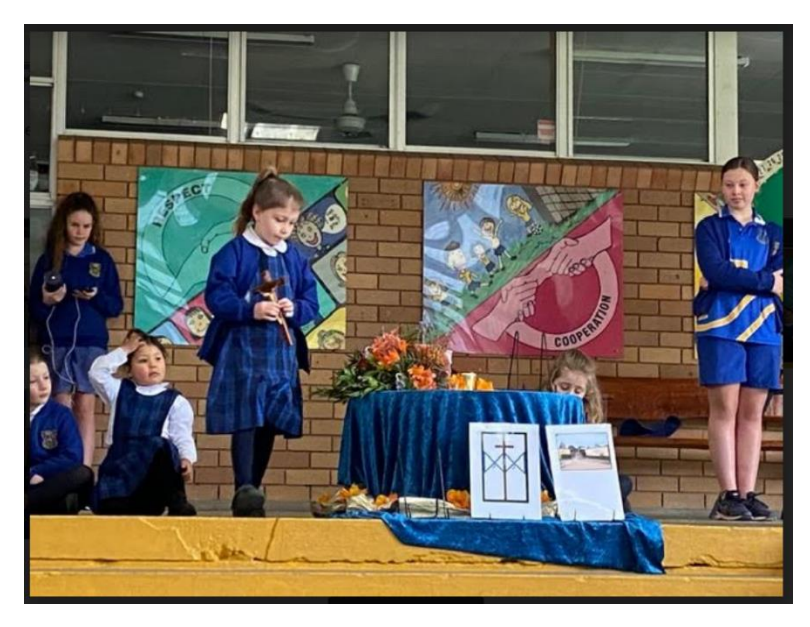
The Feast of the Assumption of Mary