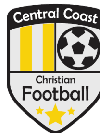
Hunter v Central Coast Christian Football Champions Match