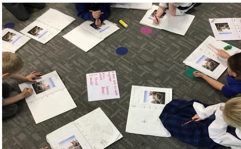
See, Think, Wonder Routine